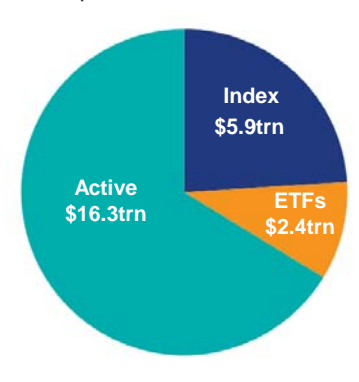
Exhibit 1: Global equity assets under external management: $24.6trn USD

Source: BlackRock estimates based on McKinsey, Markit, Bloomberg, Simfund and Broadridge data. Data is as of Year End 2015.